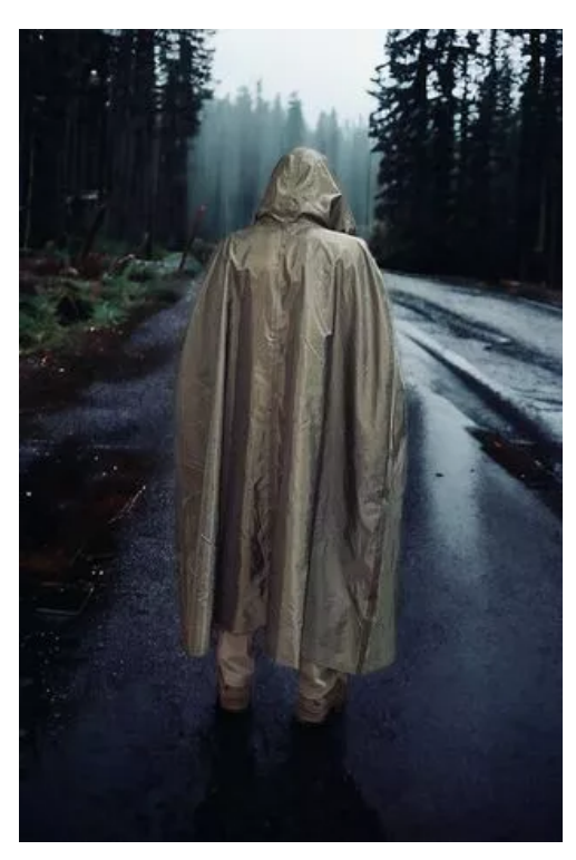
A model shows off the gear (east2west news)