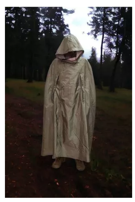
The suits will be rolled out across the Russian army