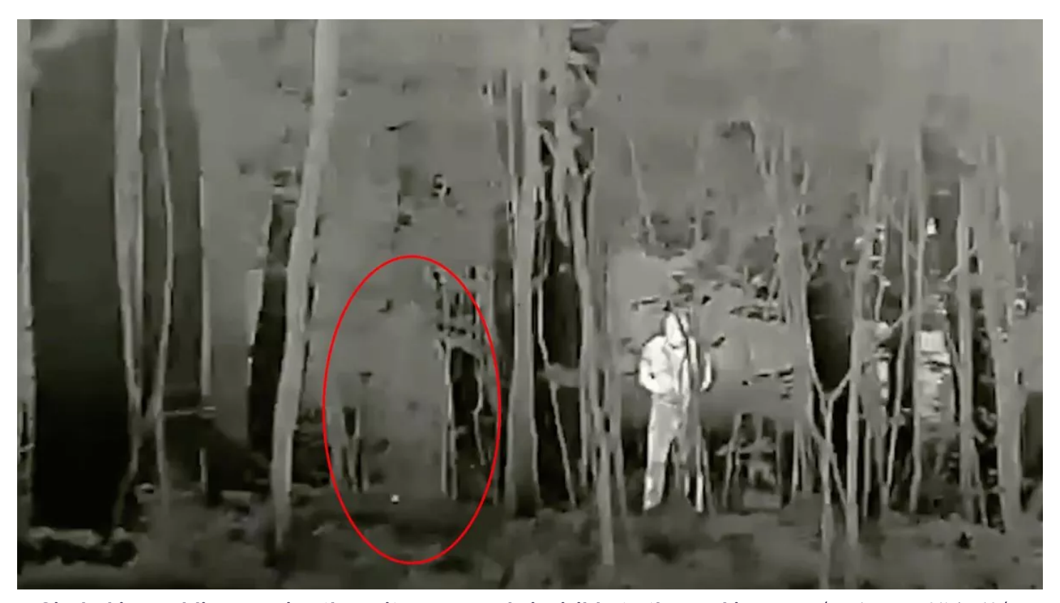
Circled is a soldier wearing the suit, now nearly invisible to thermal imagery

Read more: US producing first new type of nuclear warhead since 1980s in response to Russian threat