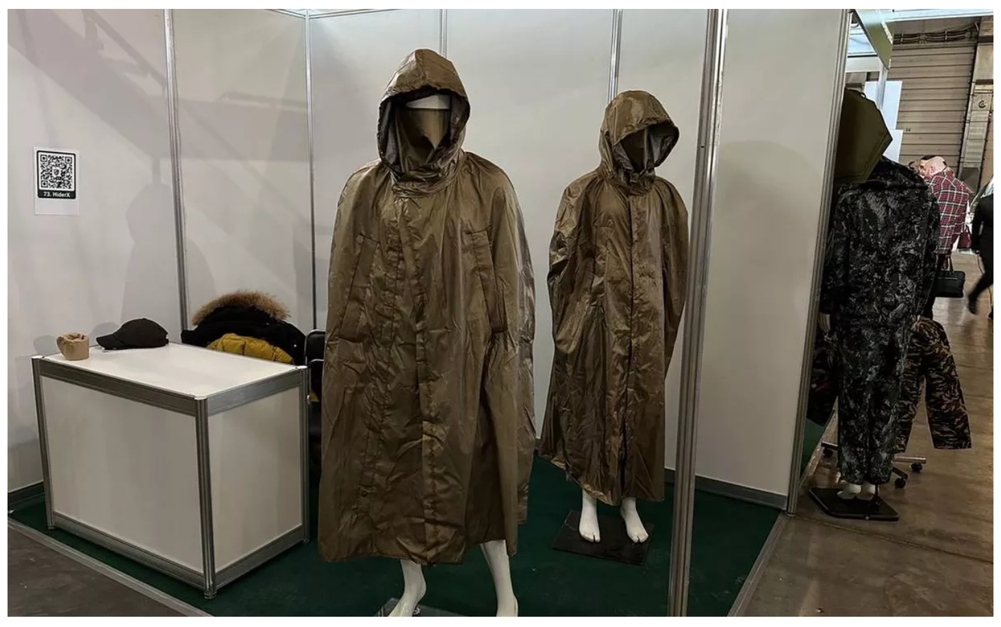
The new gear comes in different forms

"The material and technology applied to the fabric make it possible to achieve a minimum weight of 350 grams," said the Russian company. We use a different technology—shielding," said HiderX. The costs are up to £525 per outfit.