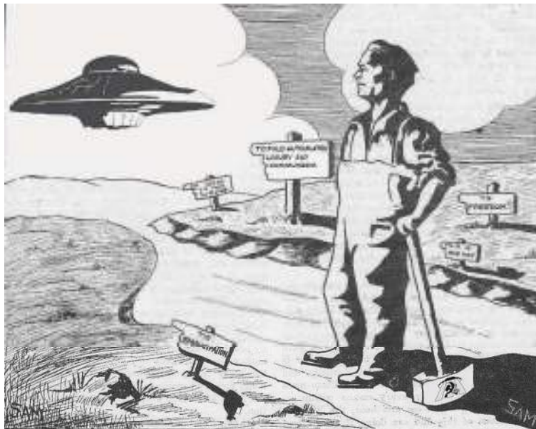
Figure 6 Memes.