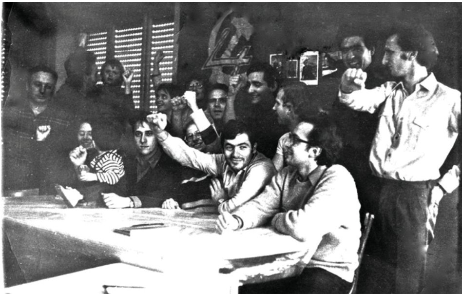
Figure 3 The Partido Comunista Rivoluzionario (Trotskyista) , Italian section of the Posadist Fourth International, in 1973.

He continued to view the meeting as positive even after Ponomarev published a text criticizing Posadism and the old Fourth International titled: “Trotskyism: Instrument of Anti-communism.” The Posadist tendency had “defined the lines of the Chinese leaders as authentically revolutionary,” it said, referring specifically to the question of preventative war, which was, to Ponomarev, a dangerous misreading of Lenin. 15