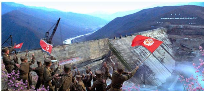
Ryongnim Dam of Huichon Power Station No.1 constructed by soldier-builders (2011)