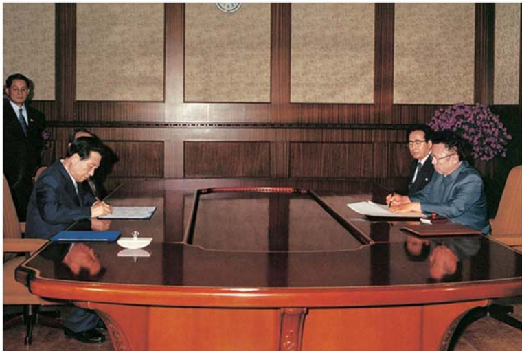
Kim Jong Il and Kim Dae Jung sign the North-South Joint Declaration (June 2000)