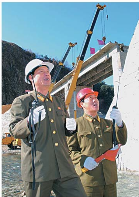
Service personnel seconded to socialist construction