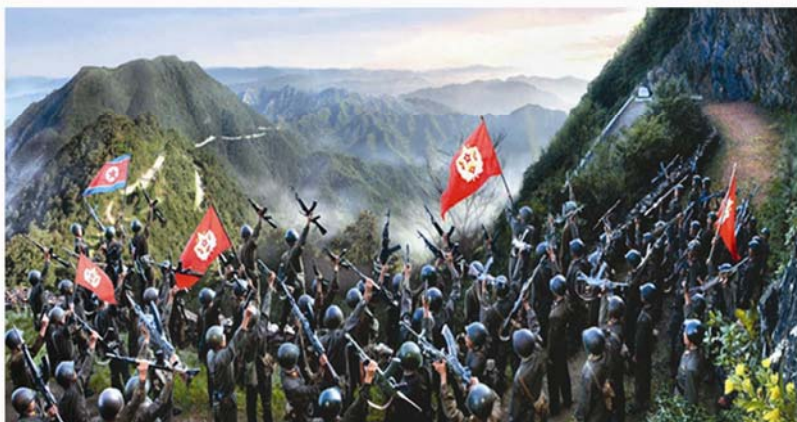
Service personnel pledge to support Kim Jong Il by force of arms