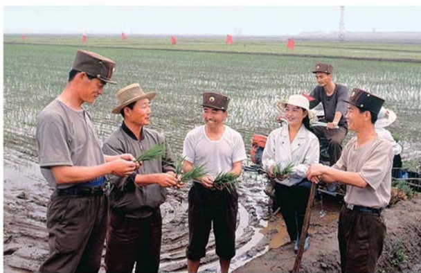
Service personnel helping farmers in their work