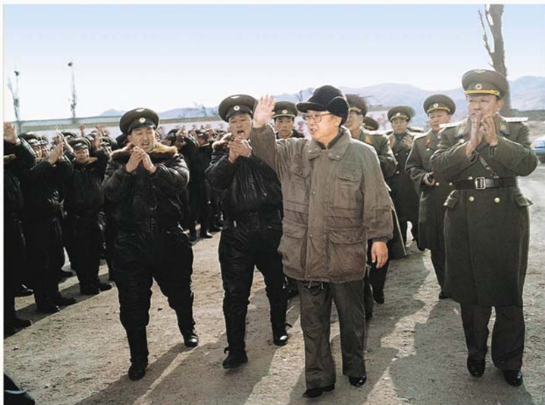
Kim Jong Il inspects a unit of the KPA Air Force (February 29, 1996)