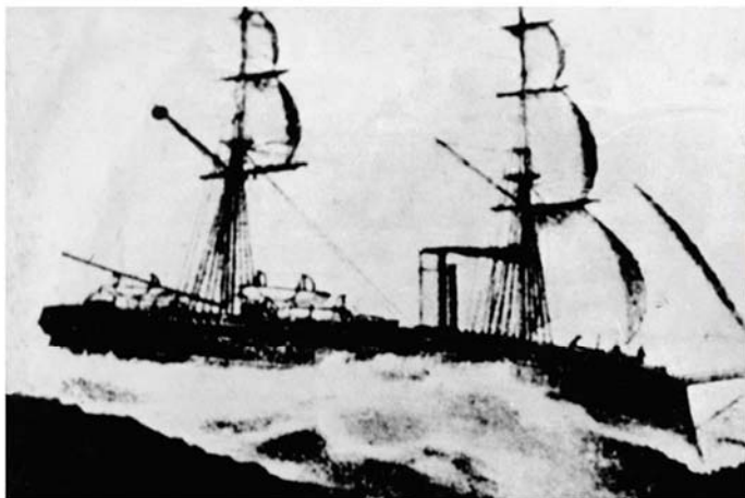
Japanese aggressor ship Unyo which intruded into Kanghwa Island of Korea in August 1875

During their military occupation of Korea, the Japanese imperialists enforced fascist colonial rule, killing Koreans in an indescribably cruel manner