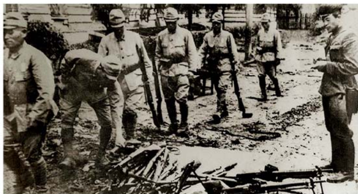
Defeated Japanese imperialist soldiers