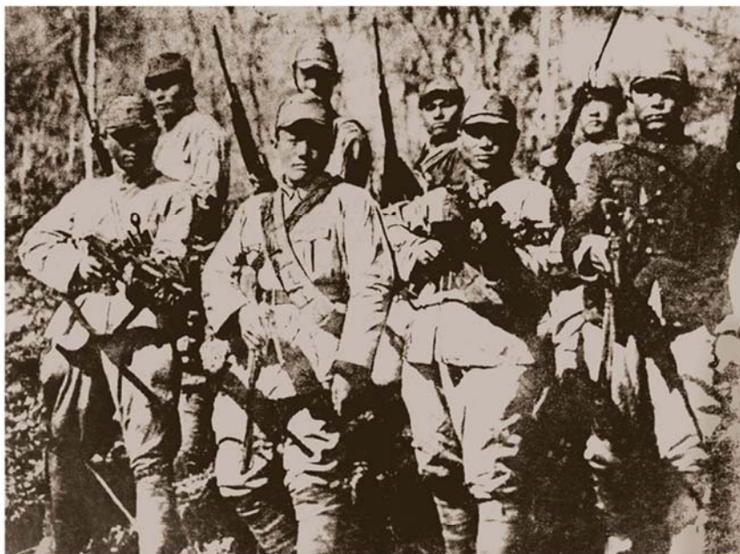
Members of the Korean People's Revolutionary Army