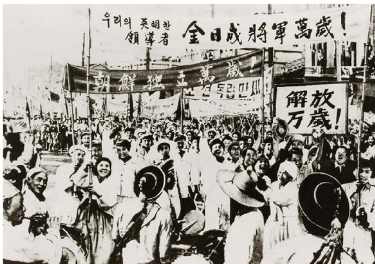
Korean people cheer over their country's liberation

The Korean People's Army is proclaimed as regular armed forces in February 1948