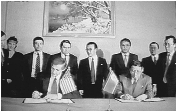
DPRK-USA talks (September 23-October 21, 1994)