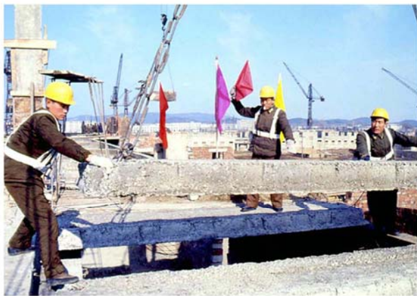
Service personnel building dwelling houses