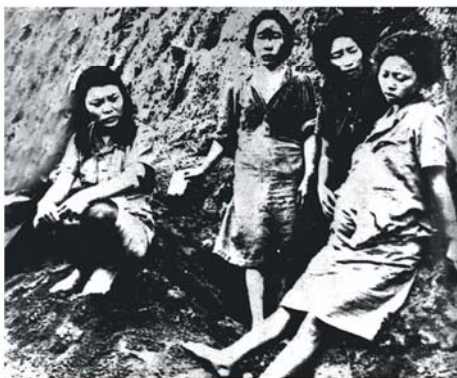
Korean women who are forced to serve as sex slaves at a comfort station of the Japanese army