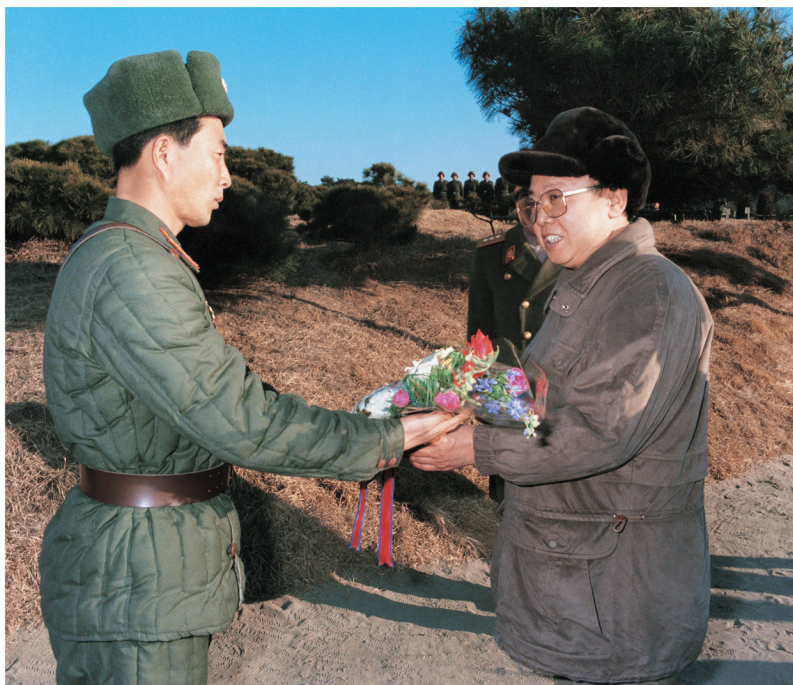
Kim Jong Il visits the Dwarf-Pine Company of the KPA (January 1, 1995)