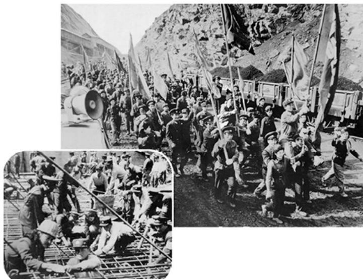
Part of the construction site of the Anbyon Youth Power Station overflowing with the revolutionary soldier spirit