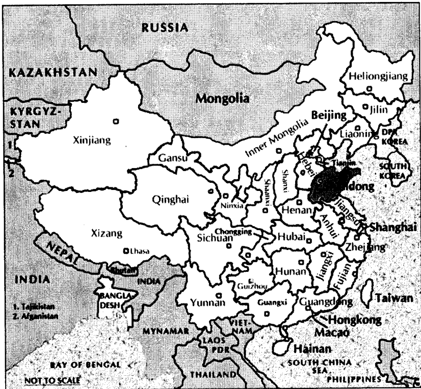
Jimo county is in Shandong province of PR China