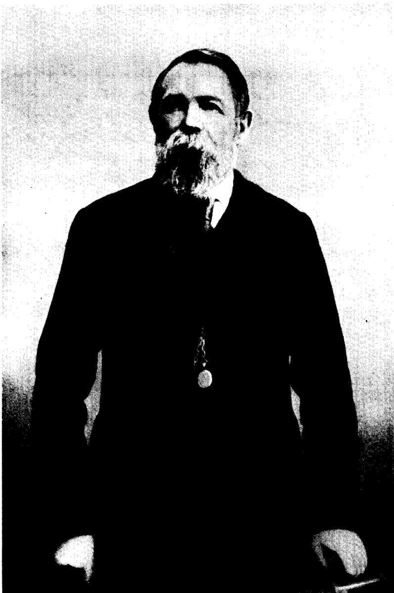
Frederick Engels. 1891.