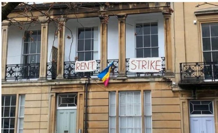
A rent strike banner from the current Bristol strike

So far, the campaign has had some success with the universities, who have cancelled the third term's rent, but are still fighting to get the private providers to cancel the payment. Solidarity, Plymouth!