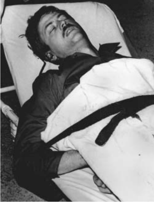
LEFT: Benno Ohnesorg after being shot by police on June 2, 1967, at a demonstration against the visit of the shah of Iran to West Berlin. He soon died from his wounds, and his death instantly radicalized the West German New Left.