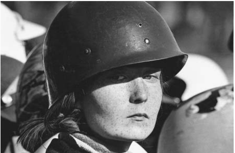
Anonymous Weatherwoman during the Days of Rage. [Paul Sequiera]