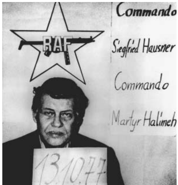
Hanns Martin Schleyer, photographed on October 13, 1977, thirty-eight days after being kidnapped by the RAF. Six days later, following the deaths in Stammheim prison of Andreas Baader, Gudrun Ensslin, and Jean-Karl Raspe, Schleyer was found murdered near the French-German border.