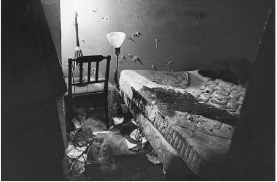
The bed in which Fred Hampton was shot and killed by Chicago police on December 4, 1969. Hampton's assassination prompted the Weathermen to go underground in the weeks following. [Paul Sequiera]