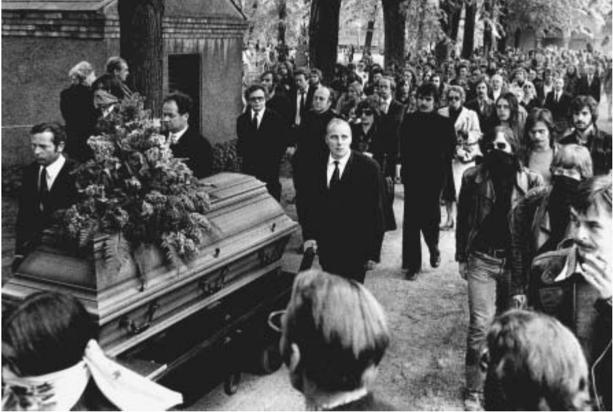
Ulrike Meinhof's funeral on May 15, 1976. Authorities said that Meinhof had hanged herself in her cell in Stammheim prison, but many on the left believed that she had been murdered. Some of the mourners are wearing masks to avoid identification.