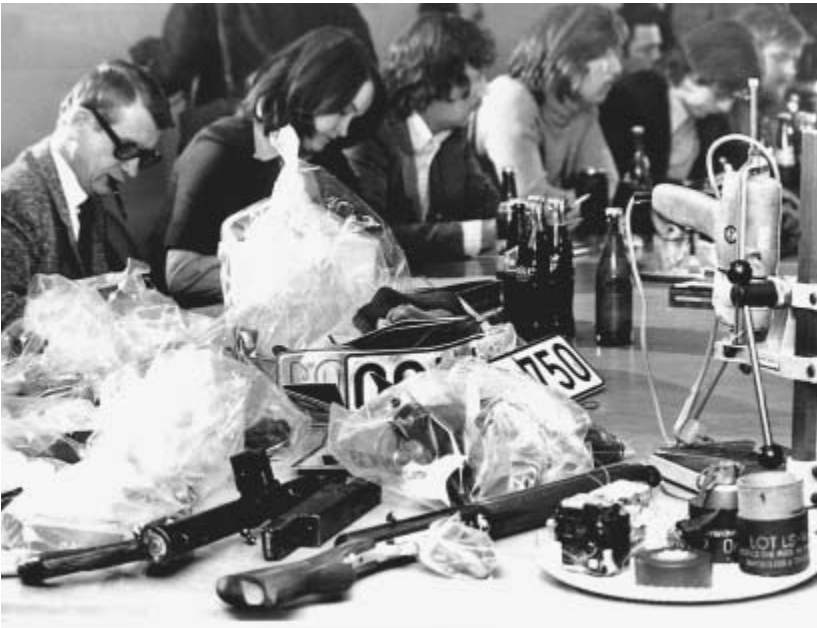
BOTTOM: Weapons seized by West German police in a raid on RAF cells in Frankfurt am Main and Hamburg on February 2, 1974. The cell, known as the "Gruppe vom 4.2" (the date of its capture), was plotting to free RAF prisoners.