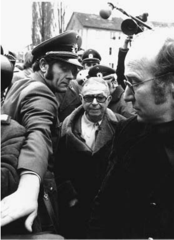
LEFT: Jean-Paul Sartre visiting Stammheim prison on December 4, 1974, to discuss the treatment of RAF prisoners with Andreas Baader. The RAF attorney Klaus Croissant is on Sartre's left.