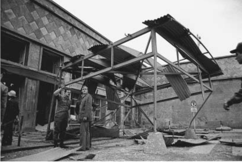
Damage from the RAF's bombing of the headquarters of the U.S. Army Supreme European Command in Heidelberg, on May 24, 1972. Three U.S. military personnel were killed in the attack, the deadliest of the RAF's 1972 "May Offensive."