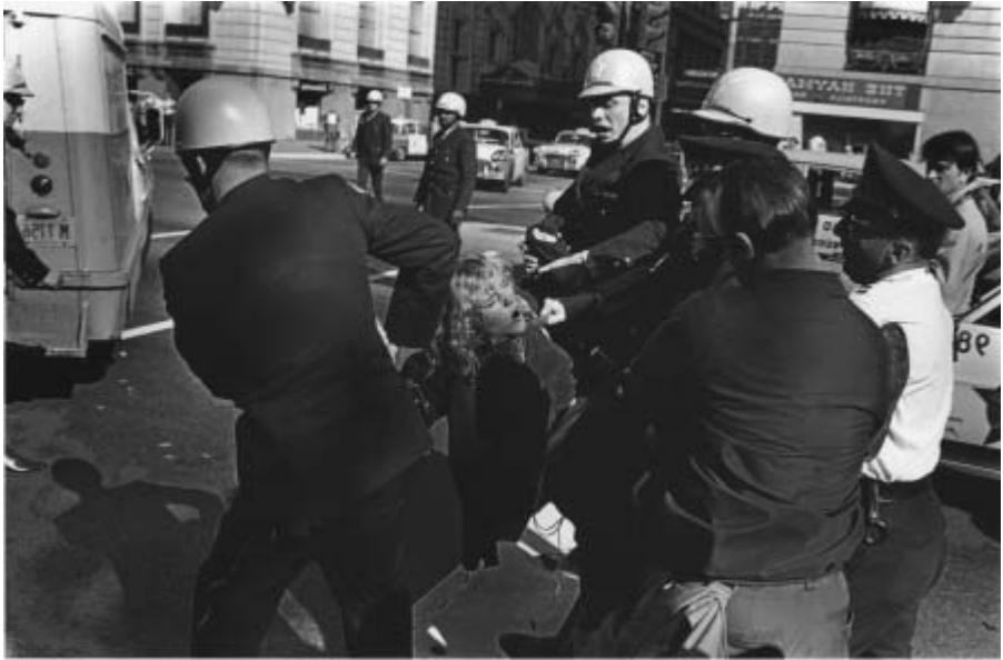
Weatherwoman being arrested during the Days of Rage.