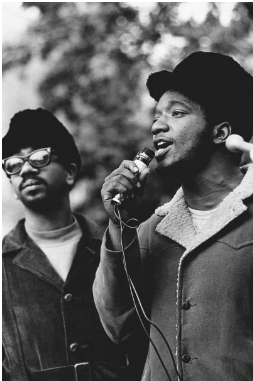
Illinois Black Panther Party Chairman Fred Hampton addresses a Chicago rally in 1969. Bobby Rush, who later became a U.S. congressman, is to his right.