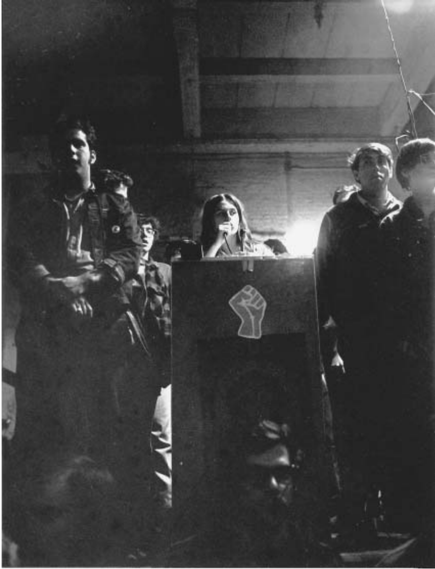
The triumphant Weathermen, now in charge of the Students for a Democratic Society, at the podium of the June 1969 SDS National Convention. Bernardine Dorhn is in the center; Mark Rudd and Susan Stern are to her left.