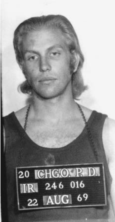
Arrest photos of Bill Ayers, Bernardine Dohrn, and Jeff Jones.